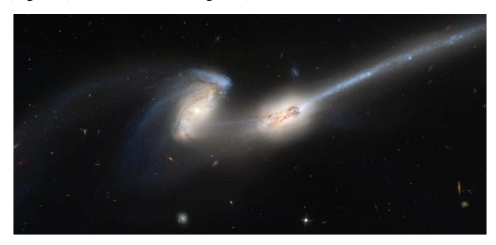
Figure 3. Hubble Space Telescope image of galaxy NGC4676.

Consider a more-or-less spherical, gravitationally bound assemblage of dark (Population III) stars, a not-yet-ignited dark galaxy. Now, consider the galactic nucleus as it becomes massive and shoots its first jet of nuclear matter into the galaxy of dark stars, igniting those stars which it contacts. How might such a galaxy at that point appear? I suggest it would appear quite similar to NGC4676 (Figure 3) or to NGC10214 (Figure 4).