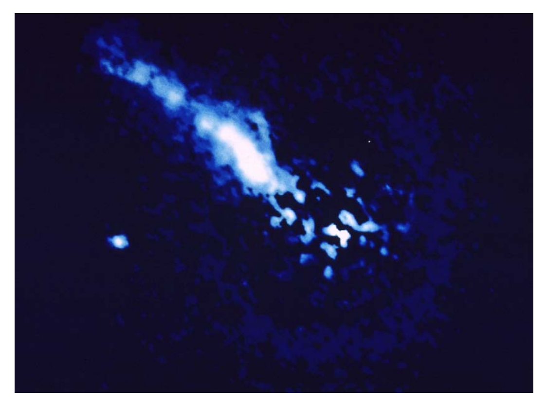
Figure 2. Hubble Space Telescope image of 10,000 light year long galactic jet from galaxy 3C66B with ambient galaxy light digitally removed.

Half a century ago, Burbidge, Burbidge, Fowler and Hoyle set forth the basis for thinking that the chemical elements are synthesized in stars, with the heavy elements being formed by rapid neutron capture in the supernova phase at the end of a star's life [9]. I do not question the possibility of heavy element formation in supernovae, but I question B<sup>2</sup>FH's lack of generality. The conditions and circumstances at galactic centers appear to harbor the necessary pressures for producing highly dense nuclear matter and the means to jet that nuclear matter out into the galaxy (Figure 2) where it seeds dark stars that it encounters with fissionable elements, turning dark stars into luminous stars.