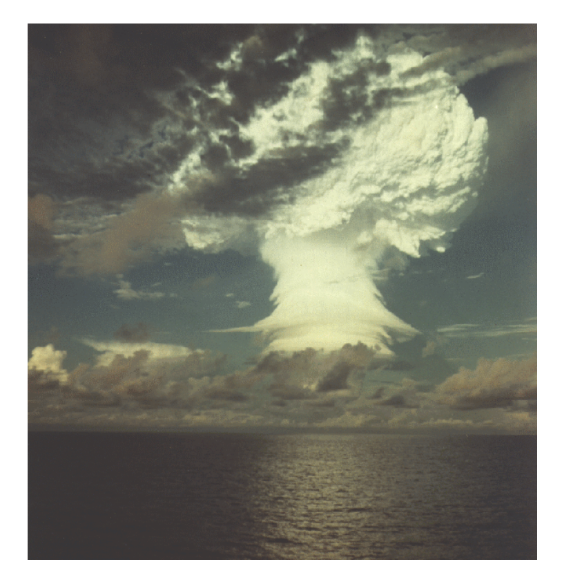
Figure 1. Experimental proof that nuclear fission chain reactions can ignite thermonuclear fusion reactions: H-bomb "mike" test Eniwetok Atoll 31 Oct 1952.

The over-riding reason for questioning science in general and astrophysics in particular is that the circumstances and knowledge at the time certain concepts were formulated may have changed with subsequent discoveries. In the case of stellar ignition, in December 1938 nuclear fission was discovered. Then, nuclear fission chain reactions were discovered, and proven capable of powering atomic bombs (A-bombs) and proven capable of igniting hydrogen bombs (H-bombs), thermonuclear fusion bombs. Every thermonuclear fusion H-bomb is ignited by its own nuclear fission A-bomb, and every H-bomb detonation is an experimental verification that nuclear fission chain reactions can ignite thermonuclear fusion reactions (Figure 1). In a paper published in 1994 in the Proceedings of the Royal Society of London , I suggested that stars, like H-bombs, are ignited by nuclear fission chain reactions [8].