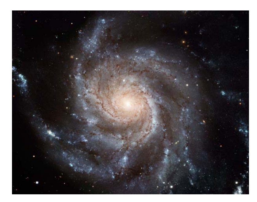
Figure 6. Hubble Space Telescope image of galaxy M101.

Bars are often found in disc galaxies [10]. Both bars and the arms of spiral galaxies, such as M101 (Figure 6), possess morphologies which, I suggest, occur as a consequence of galactic jetting of fissionable elements into the galaxy of dark stars, seeding the dark stars encountered with fissionable elements, thus making possible ignition of thermonuclear fusion reactions.