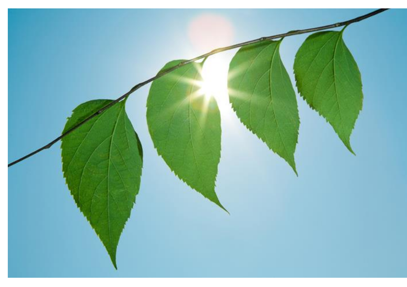
Quantized vibrations are essential to photosynthesis, say physicists