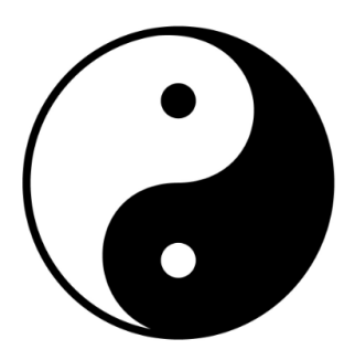
Figure 3: The non-local grid dimensions and the quantized local space-time behave like Yin and Yang.

The non-local grid dimensions and the local quantized space dimensions Are like the Chinese Yin and Yang (figure 3) where the grid dimension enables the non-locality of quantum mechanics (entanglement) and the non-locality of The Einstein's unique field equation solution of wormholes (ER=EPR). This model enables to visualize these non-local connections in a symmetrical, three-dimensional space.