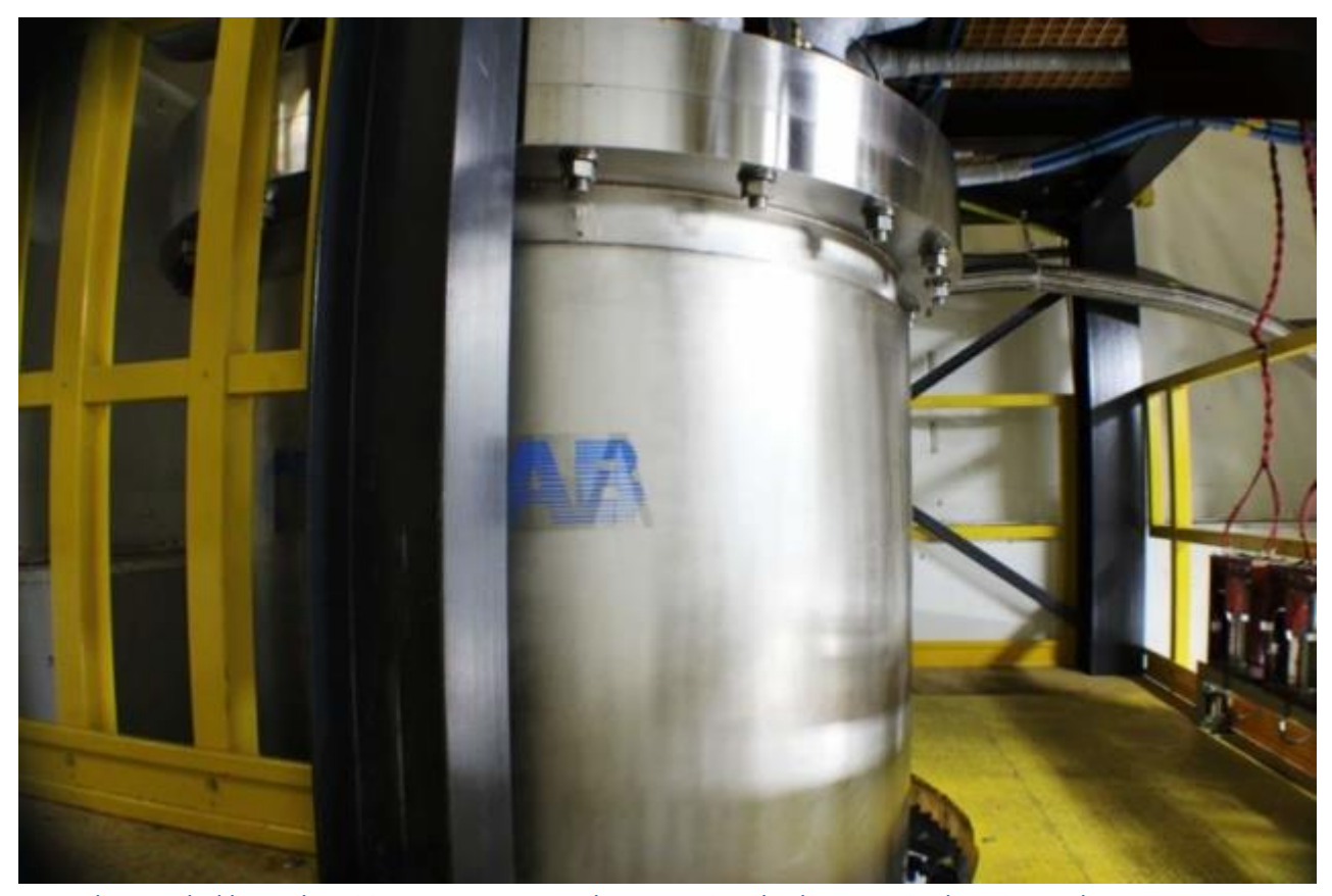
According to Shekhter, the 100 T magnet at Los Alamos National Laboratory in the US was the "real hero" of the work.

"Linear-in-temperature behaviour offers certain wiggle room to take the conventional language of metals and make it a bit more complex," he explains. "Once you have this very unusual magnetic-field behaviour at high fields it leaves much less room for speculation. As far as I know the leading theorists are still puzzled."