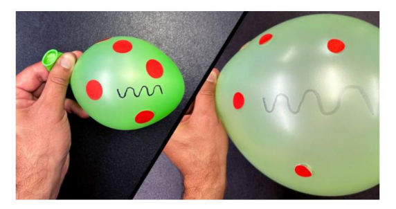
<u>Figure 2 – Model of expanding universe with</u> <u>balloons and stickers (jpl.nasa.gov)</u>

However the mathematical structure of general relativity is preserved and the machinery to affect the Fisher-Tulley Law is placed in the free constant, the Cosmological "constant". Metrics of the galaxy, considered as a Schwarzschild metric and a FLRW metric[1] shows that the non- g_{00} components of the former "swamp" the latter, such that near or within the galaxy, only matter, EM radiation and the energy density of some modified \rho_{vac} gravitate, with no expansion of space. The situation is akin to what is shown in figure 2.