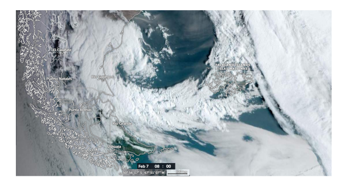
Figure 6: Image of the Dragonhead cyclone (DC), at 8 am (UTC), February 7, 2024. [Adapted Authors]Earth, 2024