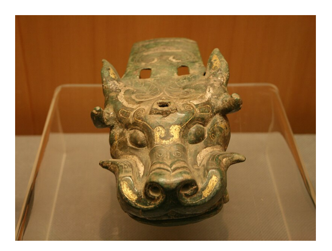
Figure 2: Bronze chariot shaft in the shape of a dragon head, Warring States period. Eastern Zhou Gallery, Henan Provincial Museum, Zhengzhou. China. Earth, 2024

The Chinese Dragon, also known as the loong, long or lung, is a legendary creature in Chinese mythology, Chinese folklore, and Chinese culture at large. Chinese dragons have many animal-like forms such as turtles and fish, but are most commonly depicted as snakelike with four legs. Academicians have identified four reliable theories on the origin of the Chinese dragon: snakes, Chinese alligators, thunder worship and nature worship.They traditionally symbolize potent and auspicious powers, particularly control over water. "Chinese dragon" 2024