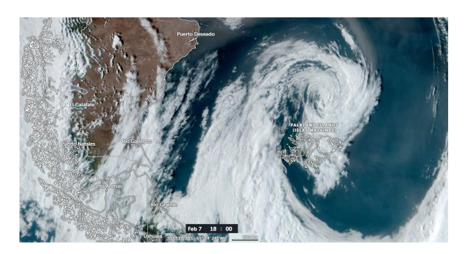
Figure 1: Image of the Dragonhead cyclone, at 6 pm (UTC), February 7, 2024. With the well-defined shape of a dragon's head. [Adapted Authors] Earth, 2024

Mitra, 2023c; Gobato and Mitra, 2023b,Gobato, Mitra, and Ahmed, 2024a; Gobato, Mitra, and Ahmed, 2024b came to the conclusion that spiral galaxies assumed the Cote's Spiral curve, as did some extratropical cyclones, south of the South American continent.