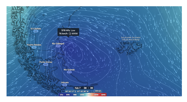
Figure 5: The Figure (3) shows isobaric and wind lines at 500 m height, in the south of the American continent. [Adapted Authors] Earth, 2024