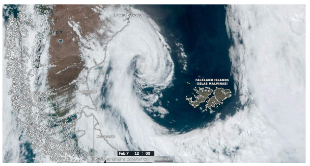
Figure 7: Image of the DC, at 12 am (UTC), February 7, 2024. [Adapted Authors] Earth, 2024

With winds coming from the Pacific Ocean, the cold front crosses southern Chile and Argentina. Forming from the region of Puerto Natales, Punta Arenas (Chile), El Calafate, Rio Galegos, Rio Grande and Ushuaia (Argentina), as shown in Figure 1, 4h UTC on