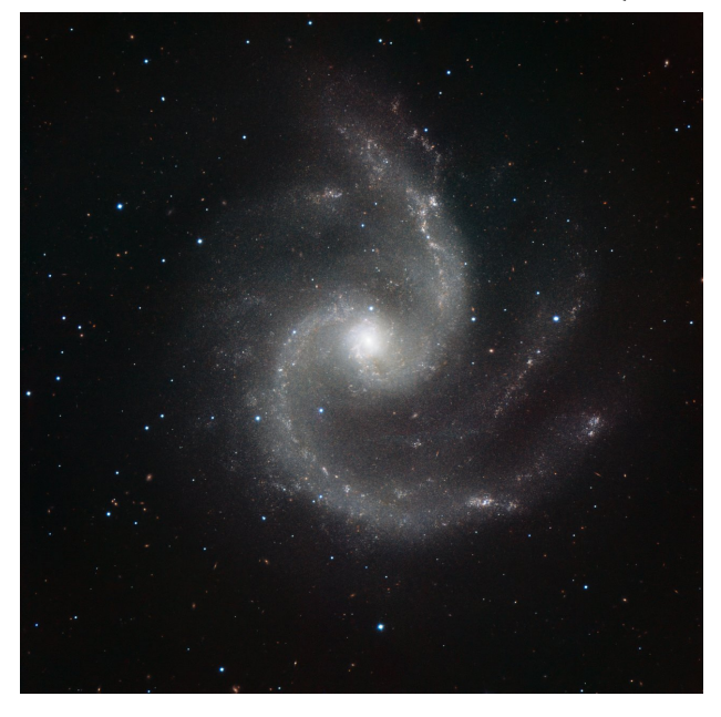
Figure 3: HAWK-I image of NGC 5247 Galaxy Grosbol, 2010

providing an excellent view of its pinwheel structure and multiple arms. It is in the zodiacal constellation of Virgo (the Maiden). Grosbol, 2010